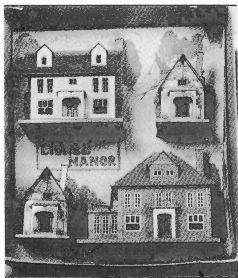
"LIONEL MANOR" SET #192 PHOTO 1

Lionel production was well represented with 8 different #184 bungalows, 6 different #192 villas with porches, and a white #189 villa with peaked peacock roof and 4 dormers (photo 7, shelves D&E. One of the #191 villas was the earlier version with no dormers, (photo 7c, left). Two of the bungalows are the original, but differently labeled boxes. Ron Morris treated us to a display of two rarely seen and very impressive, boxed sets of LIONEL houses from the late 1920s, (photos 1 & 2). The #192 set, labeled "LIONEL MANOR"; contains 2 lithographed bungalows, a #189 white villa with gray roof and dormers and a crackled red #191 villa with green roof and railings, white windows and a brick chimney. The #186 set, labeled "LIONELVILLE", contains five lithographed #184 bungalows