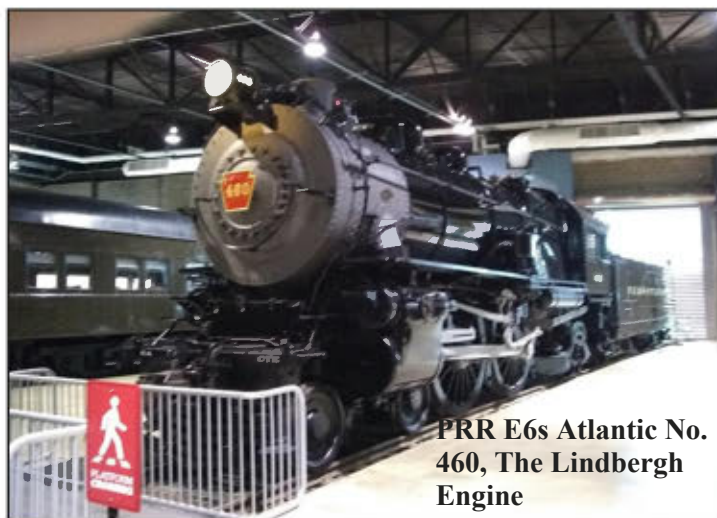
PRR E6s Atlantic No. 460, The Lindbergh Engine

Railroad Museum of Pennsylvania, Strasburg, PA. www.rrmuseumpa.org