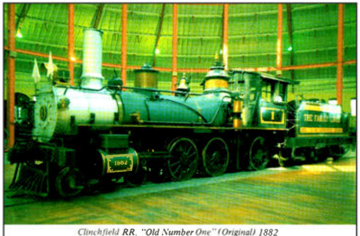
Climaxfield RR. "Old Number One" (Original) 1882