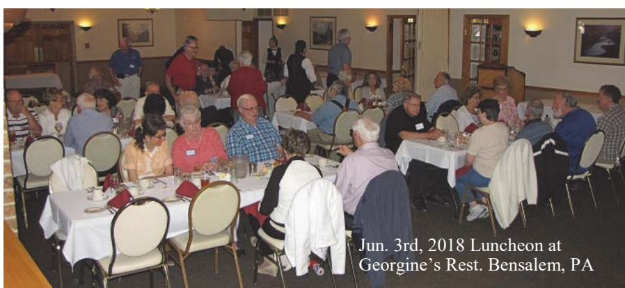
Jun. 3rd, 2018 Luncheon at Georgine's Rest, Bensalem, PA