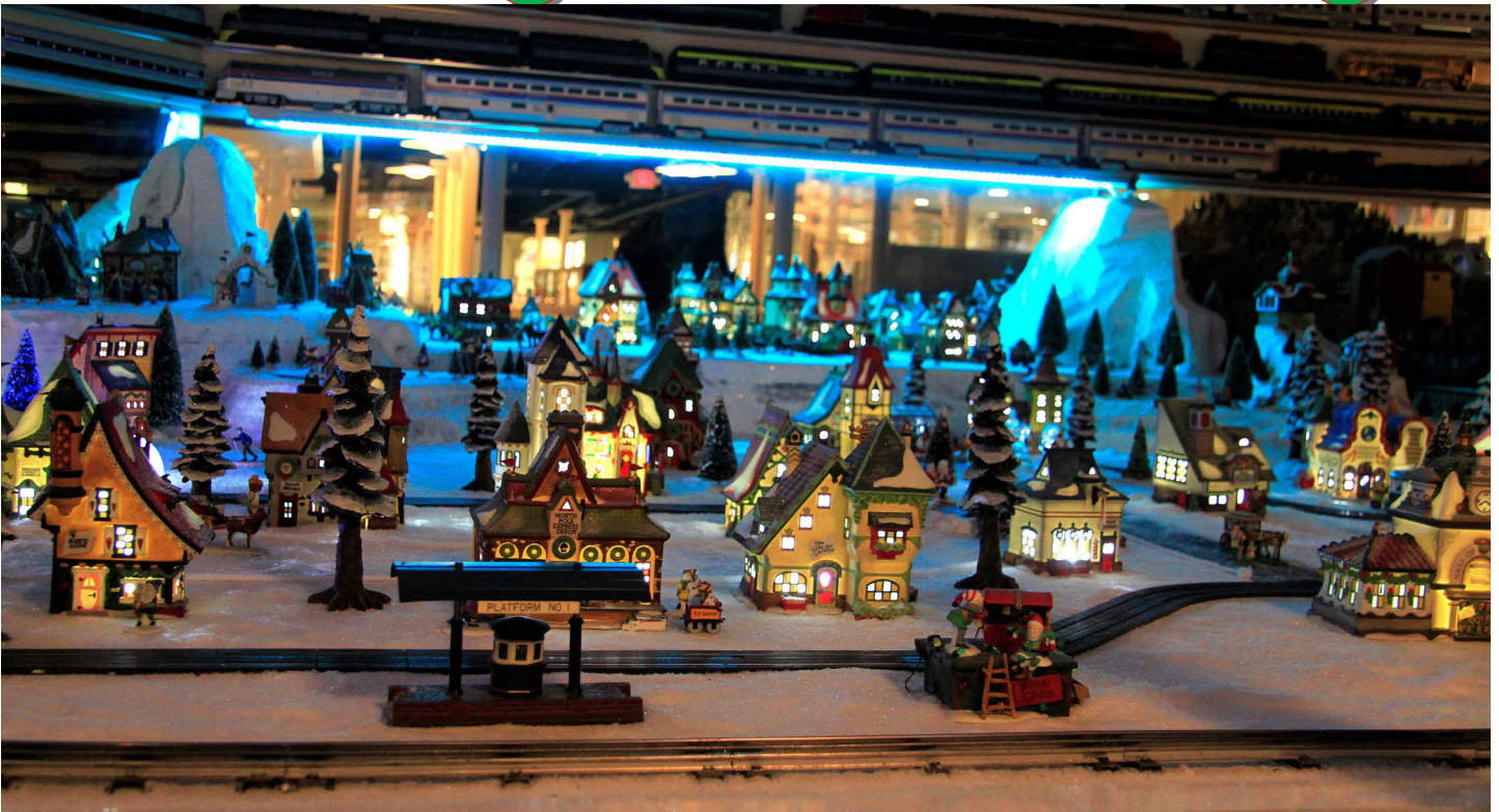
National Toy Train Museum's Department 56 Display changing from day into night