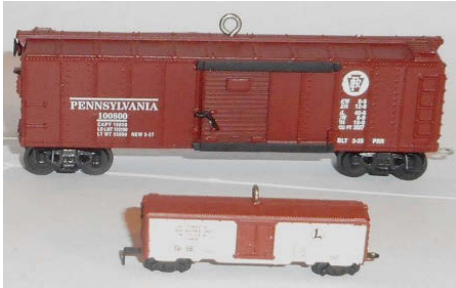
2004-LIONELVILLE- MAGIC DISPLAY