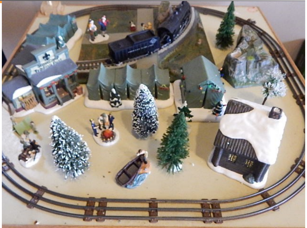
Boy Scouts assembled this modular layout of a Scout Camp at the March 5th Railroading Merit Badge workshop held during the Division's train show. Additional details and pictures on page 2.