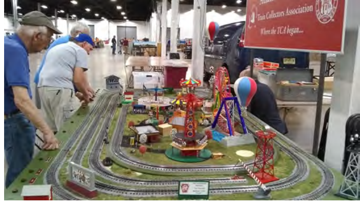
Continued on page 6