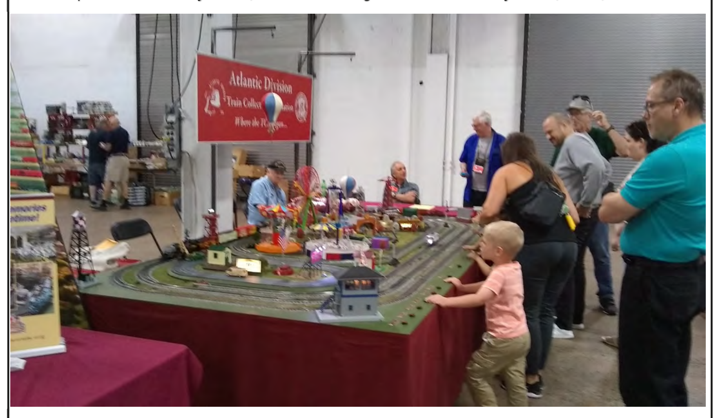
The final product at the July 16-17, 2022 Greenberg's Great Train & Toy Show, Oaks, PA

At this show, the display below was provided by the TCA to promote the organization to the attendees. Applications for membership with a map to our museum were available.