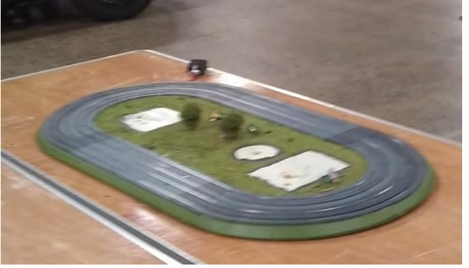
The Amusmet Park accessory platform (left) and the Superstreets one above.

The accessories are unpacked and placed on the platforms where labeled. Each one is connected by a pin-to-socket beneath the board. At some point, the most flexible person available is sent underneath to mate the dangling wires from the accessories to their designated connectors. ( Side note. The assembly crew is getting a little stiff in the joints to do this easily. We need younger members with flexible hips and knees to easily make this happen. )