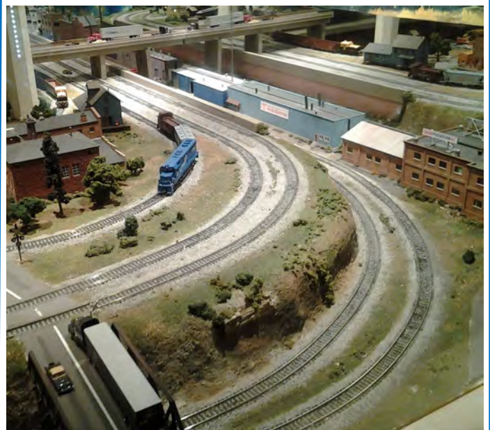
Picture from 2018 of a display at the National Toy Train Museum