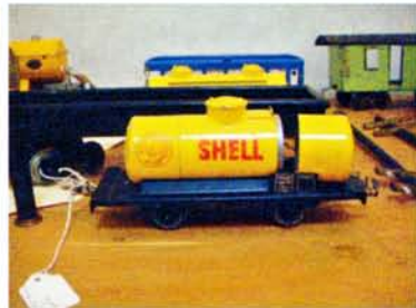
A Very unusual tank car with a removable end