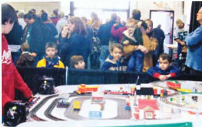
The layout was a hit with the youngsters

The next event to which we were invited was the WGHS held in early January at a newly opened Convention Center in Oaks, PA. We were scheduled to share exhibit space with National. We displayed our traveling layout.