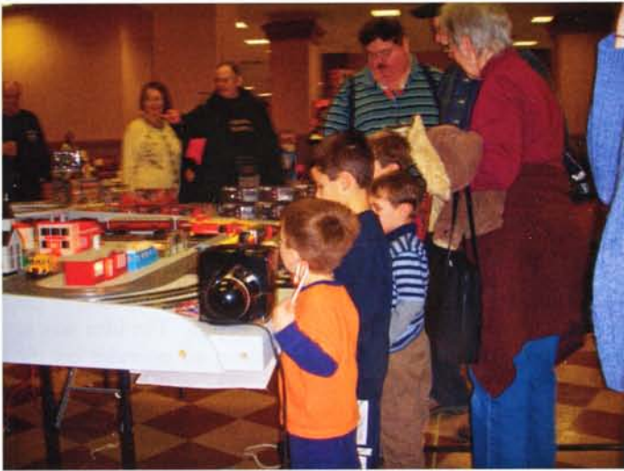
A great young audience