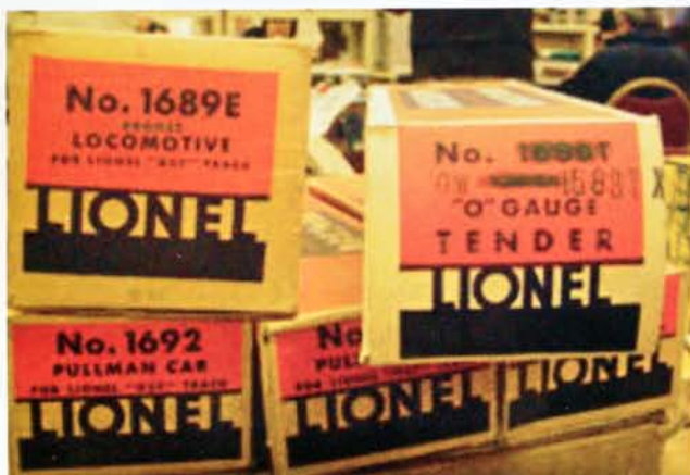
The Set Boxes