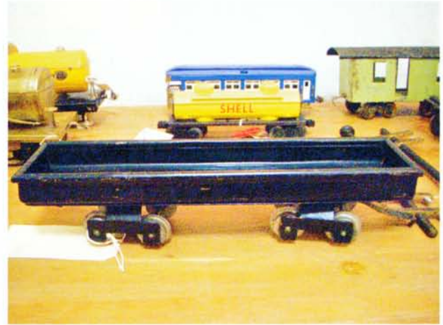
A very unusual Gondola. Shows that you can make railroad cars from anything

Young Brandon Becker drew the winning ticket for the drawing