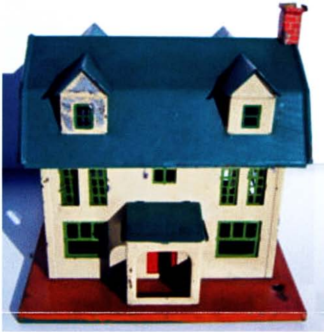
Looks like a 189 Villa

Several months ago I purchased a lot of several Lionel Villas at an auction. I only wanted to keep one and have been placing the others on eBay. One of them was a No. 189. However, in viewing the pictures of one for listing, I thought I made a mistake but I did not. As you can see from the pictures, this is a 189 Villa that is stamped 191 on its base. I have labeled this villa, Lionel Manufacturing Plant, Monday Morning.