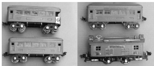
A Pre-war Lionel 296 Passenger Set in Peacock with Orange trim. (We are looking for a set box for the 296 Set)