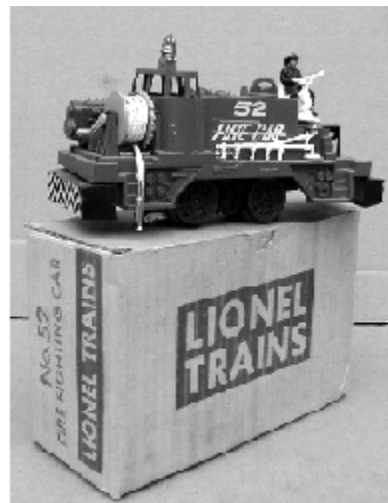
A Post-war Lionel 52 Firefighting Car in the original box with insert.